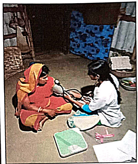
Plate 1: Different activities during survey of antacid consumer woman of Bhagwanpur-II Block area